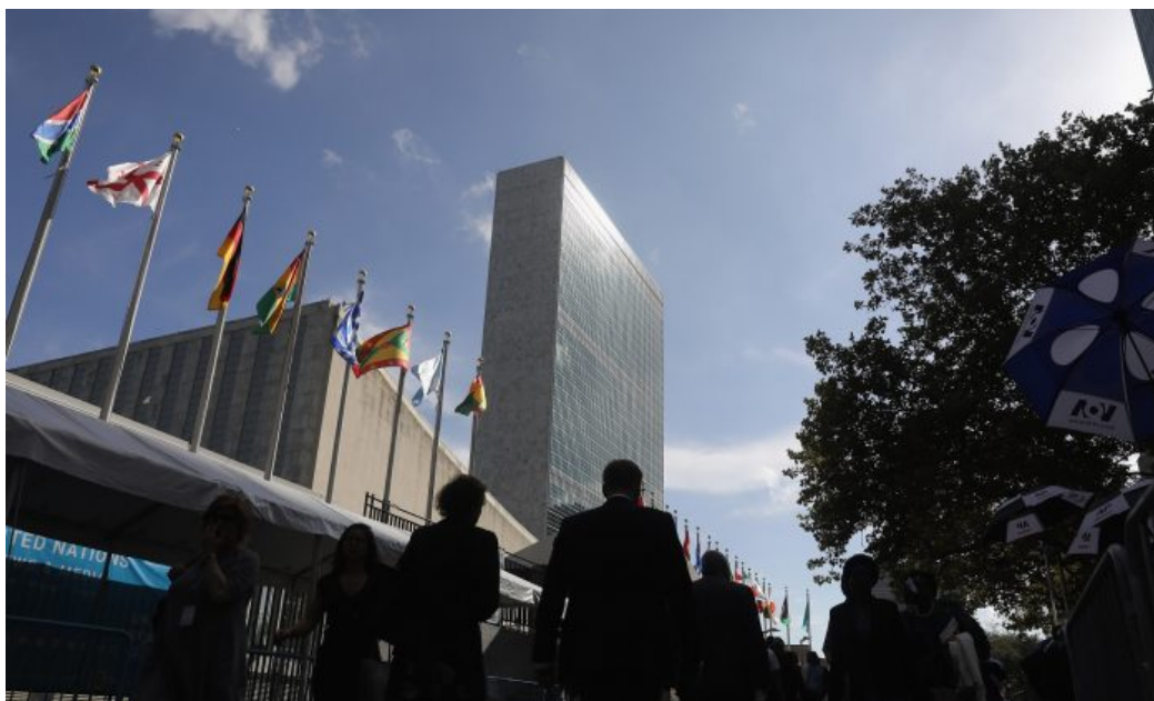
People walk past the United Nations headquarters in New York City on Sept. 26, 2018.